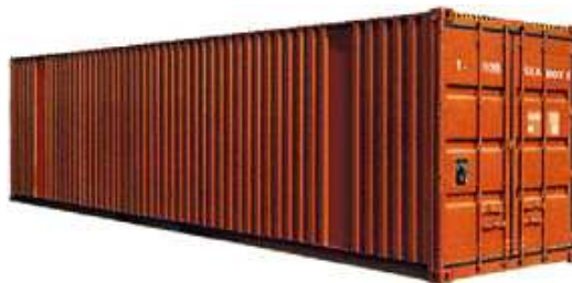
40` DC standard container