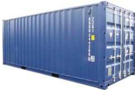
20` DC standard container

The container are designed for transportation of any general cargoes without container, including foodstuff in original packing, the standard unified cargoes and cargoes on pallets and can be used in any climatic zones at temperatures from -50°C to +70°C, be applied on any vehicle or at multimodal transportations.